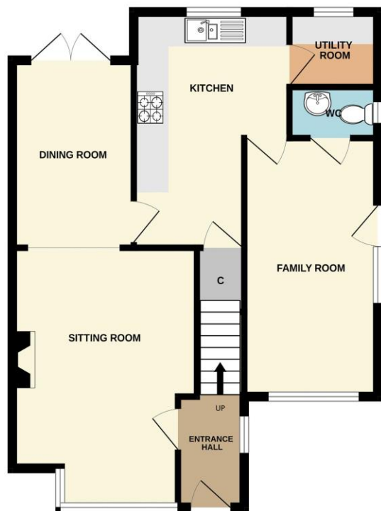
GROUND FLOOR 593 sq.ft. (55.1 sq.m.) approx.